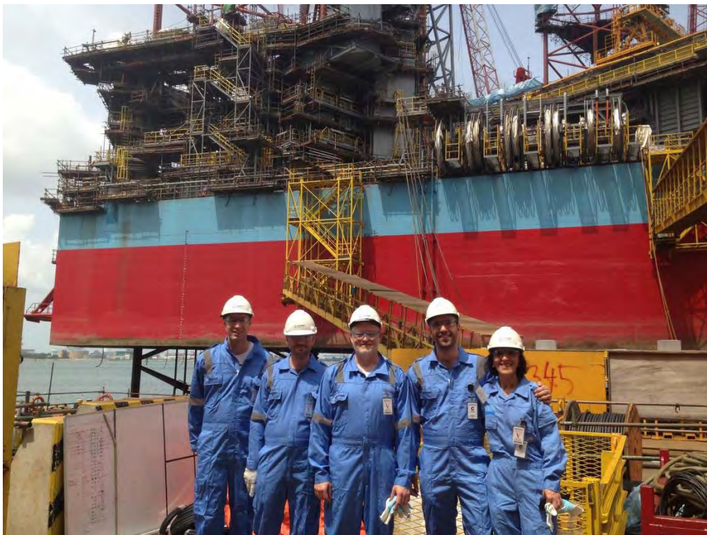
CBS Maritime visit in Singapore, Keppel FELS Shipyard, January 2014.