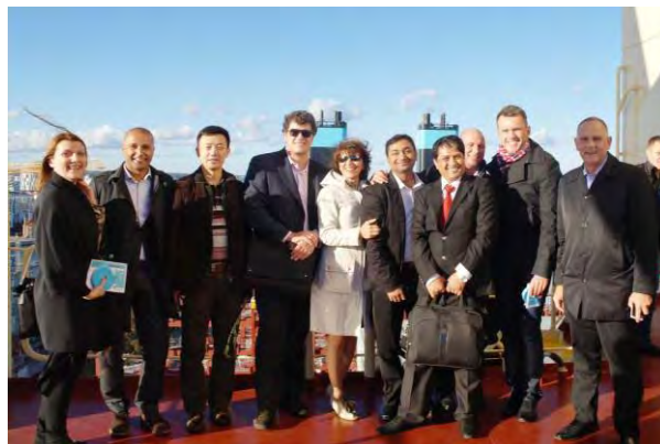
A delegation from the Blue MBA visits “Majestic Maersk”, Copenhagen in September 2013.

The Executive MBA in Shipping in Logistic is a unique program, which attracts shipping professionals from all corners of the globe. Participants develop a strong network spanning across continents and companies, which will last a lifetime.