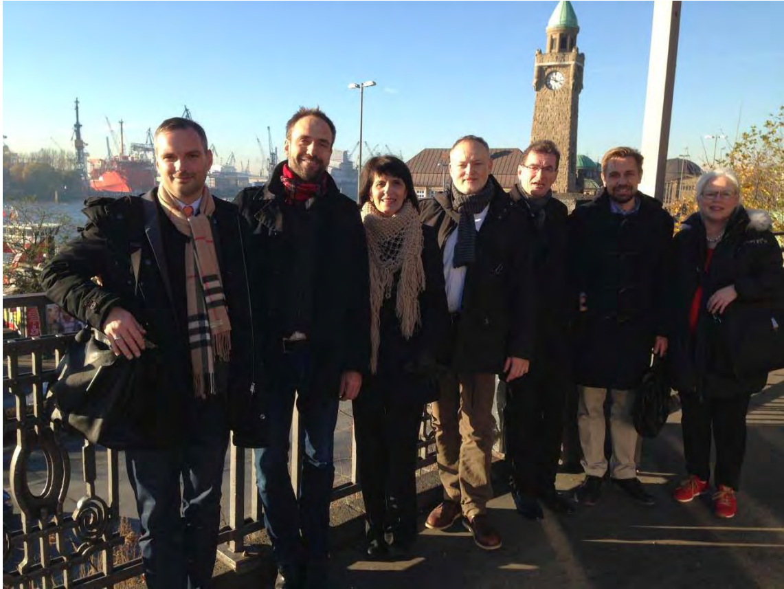
CBS Maritime visit in Hamburg, November 2013.

research and teaching within the Maritime area across CBS departments. Within a year and a half several persons within CBS Maritime succeeded in obtaining institutional accreditation from the national accreditation body in Denmark, ACE Denmark, for the Blue MBA as well as for the new B.Sc. in International Shipping and trade.