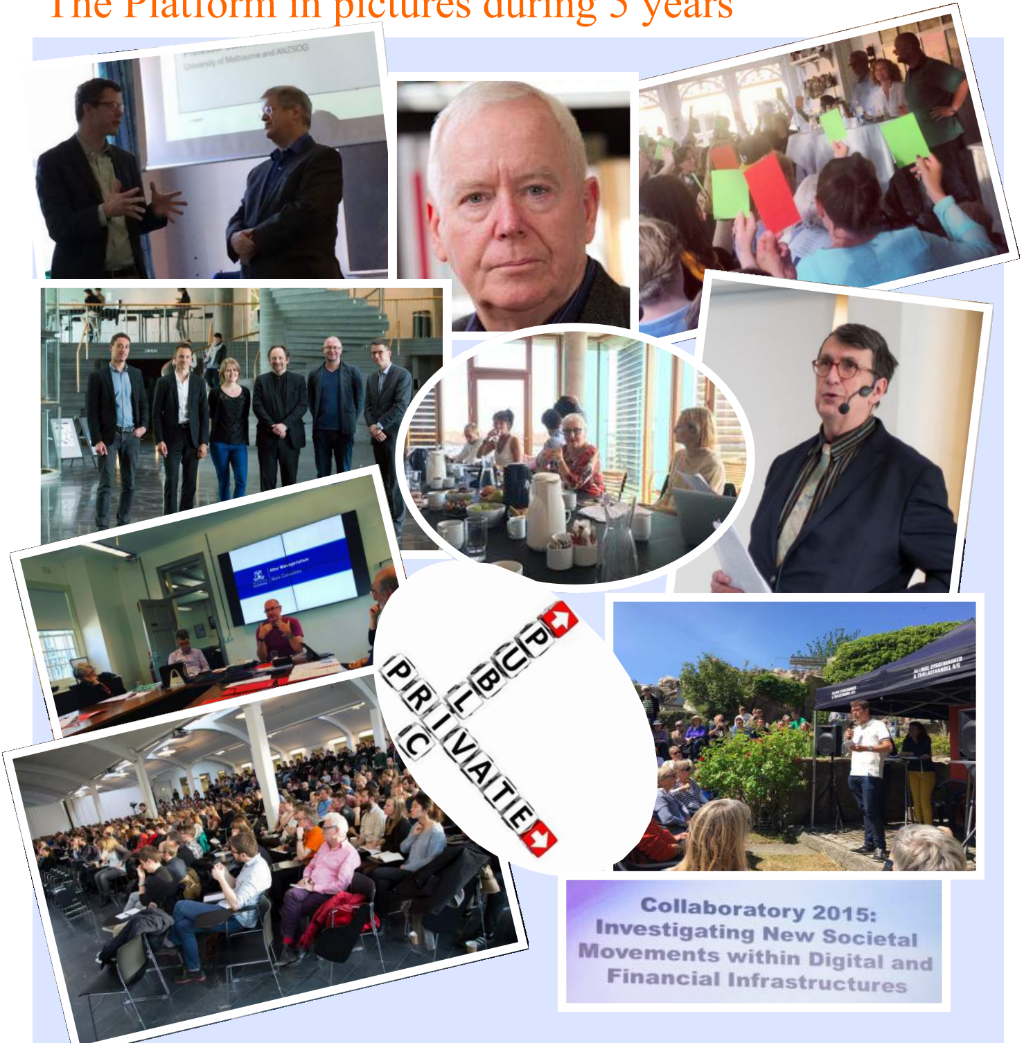
Collaboratory 2015: Investigating New Societal Movements within Digital and Financial Infrastructures