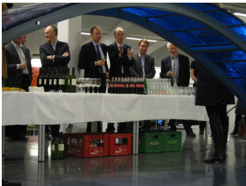
Snapshot from a reception at the Center for Corporate Governance 28. November 2009.