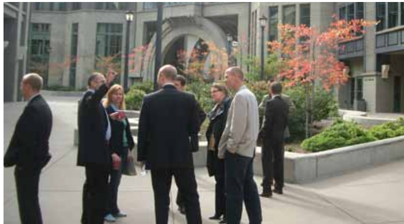
Flexible Executive MBA participants visiting University of California Berkeley, USA

During Term 1, Leadership & Business Essentials, participants will visit California. You will meet some of the icons in the area of marketing and branding in this region. Lectures will take place at the University of California, Berkeley and Stanford University. Furthermore, working in groups, participants will work on a hands-on assignment to market a new product in the USA.