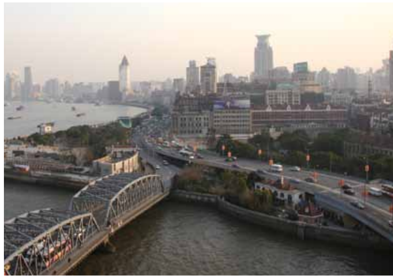
Shanghai Harbour, China

Term 2 – Business Development and Innovation will include a study tour to Shanghai and Beijing. You will be exposed to companies and organizations operating in the Chinese system. You will gain an understanding of how international companies have entered the marketplace and operate in China. Lectures will take place at Fudan University and Tsinghua University.